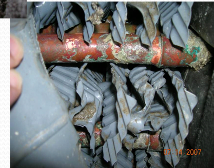
2 months of ElectroLIFE