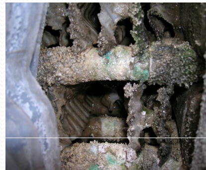
After years of chemical treatment